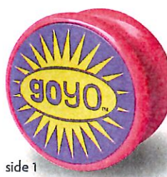
NED YO Glow-in-the-Dark